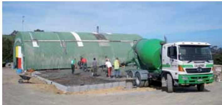
Above: Sonshine Ranch foundations - 2010 Below: Sonshine Ranch now - almost finished