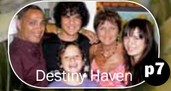
Destiny Haven p7